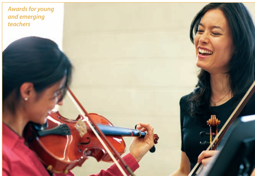
Awards for young and emerging teachers

This year's examination experience will be all about celebration. Centers will be focused on creating an atmosphere of joy and participation. To give our students a sense of history and being part of a lifetime legacy, all examination candidates will receive a participation certificate as well as a special 125th-anniversary commemorative medal from the examiner.