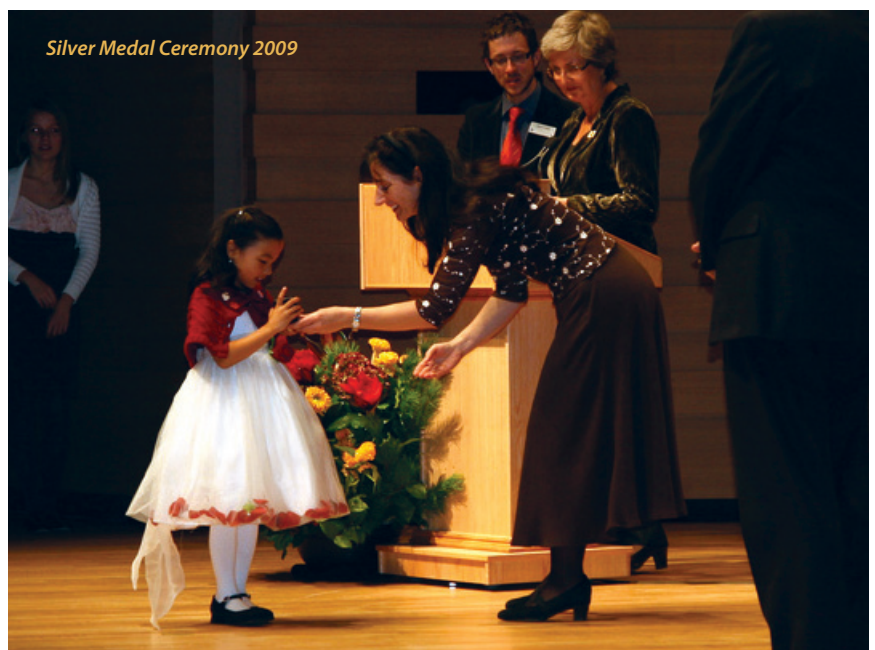
Silver Medal Ceremony 2009

Planning for the 125th-anniversary year is well under way and these events are just some of the exciting initiatives that we will be launching. We celebrate this milestone year with the teachers, students, alumni, examiners, and parents who have all helped to create, build, and sustain the organization. We encourage you to get involved and we welcome your feedback, ideas, and suggestions. Most of all, we look forward to having you join us as we celebrate 125 years of fostering a culture of creativity in Canada, the United States, and beyond.