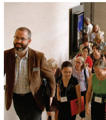
Attendees touring the TELUS Centre for Performance and Learning

“It was great meeting and sharing with teachers from so many places, all with similar goals and challenges.”