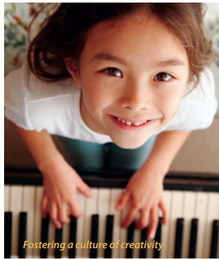
Fostering a culture of creativity

We are looking forward to hearing your ideas and connecting through our website for alumni, teachers, and parents. We are thrilled to celebrate the work of teachers across the country and the accomplishments of our new and continuing students who are all part of our community. One-hundred-and-twenty-five years of pedagogical excellence and arts leadership is unparalleled. Our partnerships and relationships with teachers continue to embody music as an essential aspect of human development. We are leading the way to maintain the value of holistic education and quality in music experience. This is the year for rejuvenating our teaching and giving our students a sense of history, legacy, and mission in music.