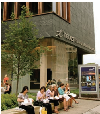
Attendees networking outside the TELUS Centre for Performance and Learning

“I enjoyed being able to look at my teaching in a different way, using the great ideas that were presented.”